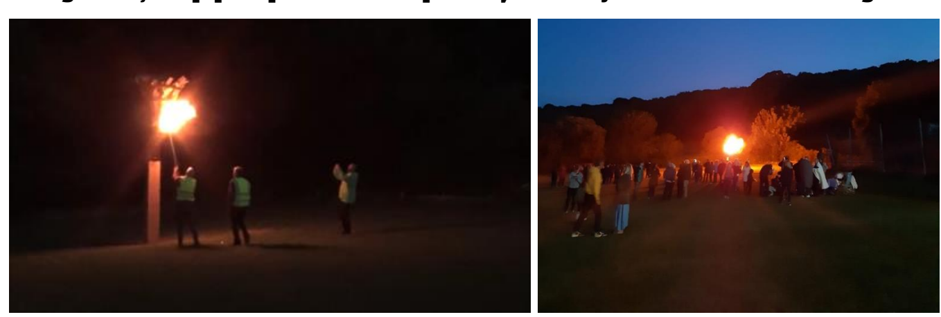
Then it was time to light the beacon at 9:45 pm, one of over 3000 beacons being lit around the United Kingdom and across the Commonwealth