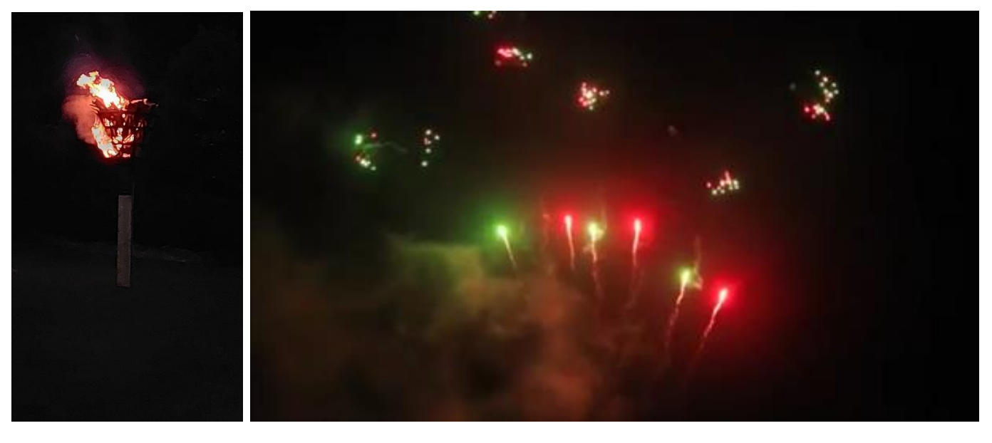
Finally, the evening finished with a firework display