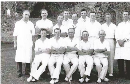
1952 - EDFCC on tour at Pevensy Cricket club