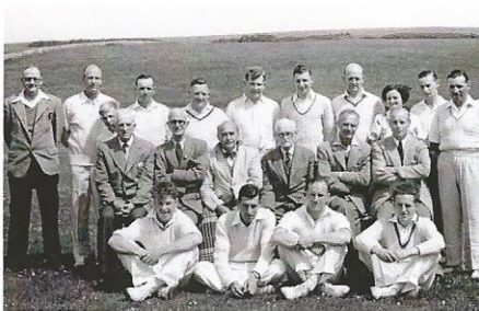
1952- EDFCC Cricket members

Your Club's committee has ambitious plans to improve the Club in terms of the wicket, organisation and communication within the Club, improving cricket skills and growing membership. We look forward to working with all Club Members to build a strong and enjoyable future for the East Dean and Friston Cricket Club!