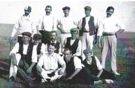
Year unknown - EDFCC players