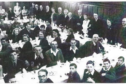
1948 - EDFCC Club dinner at The Bardolf Hall