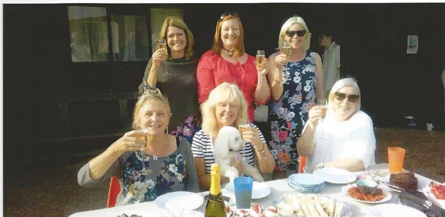
The tea ladies of East Dean and Friston CC

Please get in touch with the Honorary Secretary.