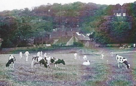
1959 - Cricket at EDFCC Club