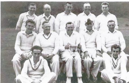
1956 - EDFCC Cuckmere Valley Champions