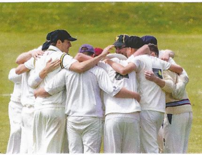
2017 - 1st XI celebrating a wicket

All in all, 2018 was a successful year for the club and membership increased to 70 playing members.